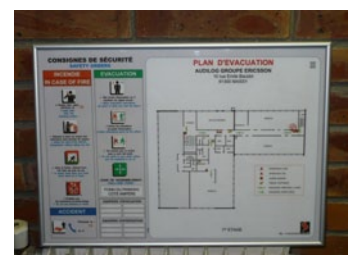
Evacuation map of EXTENDE